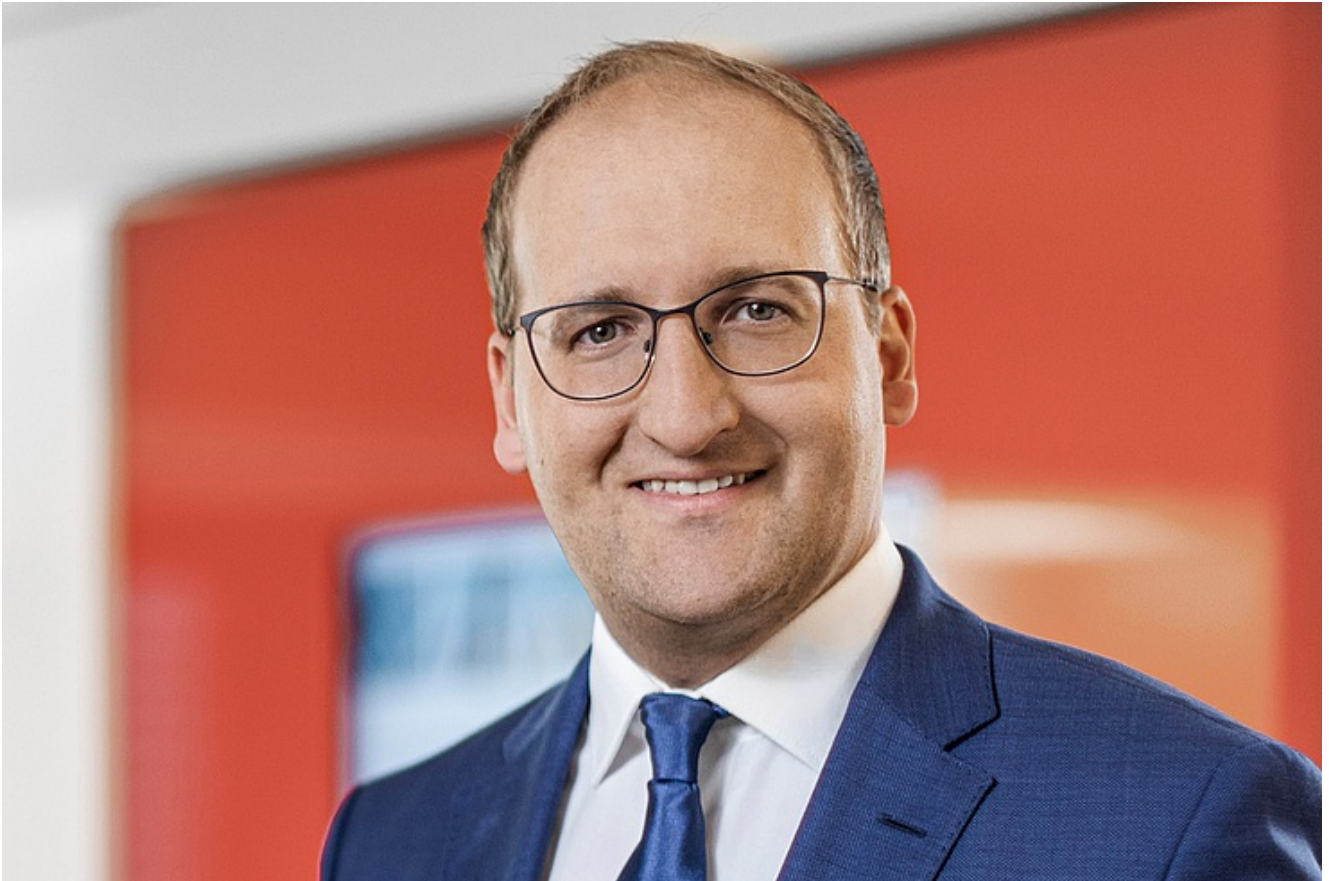
Dr Julian Linz